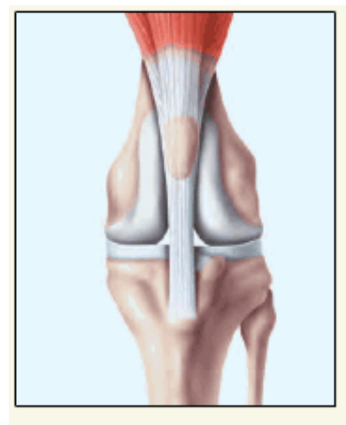
Normal patellar alignment. The patella and quadriceps are in alignment and the patella is seated in the groove.

Patellar Luxation – A physical exam by the veterinarian or specialist will determine the presence of luxation, whether it's unilateral or bilateral, and to what degree. This evaluation can be done on any dog over 12 months of age. This form is submitted to OFA for certification: http://www.offa.org/pdf/plapp_bw.pdf