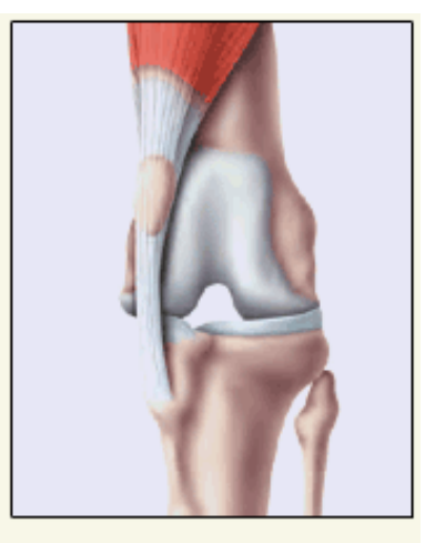
Medial patellar luxation. The quadriceps and patella are medial to the trochlear groove and the tibia is rotated medially.